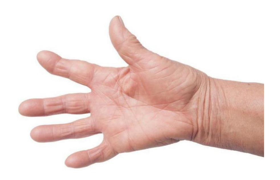
Arthritis (rheumatoid, psoriatic, lupus, etc.)