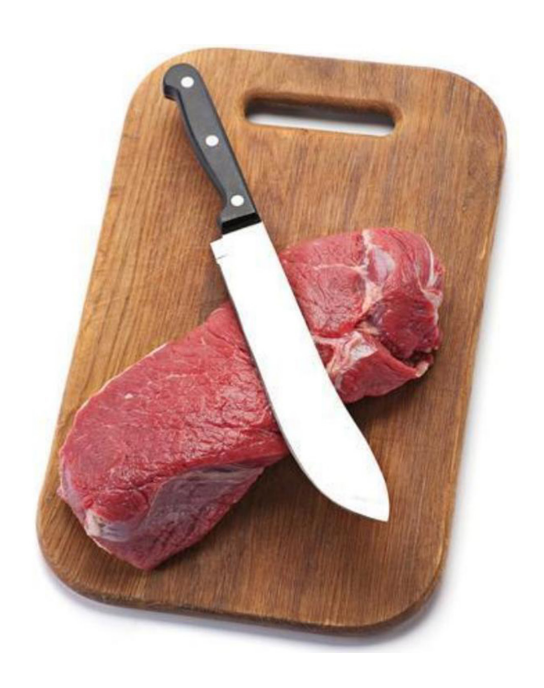
Meat (cows, pigs, lambs, deer, buffalos, whales, etc.)