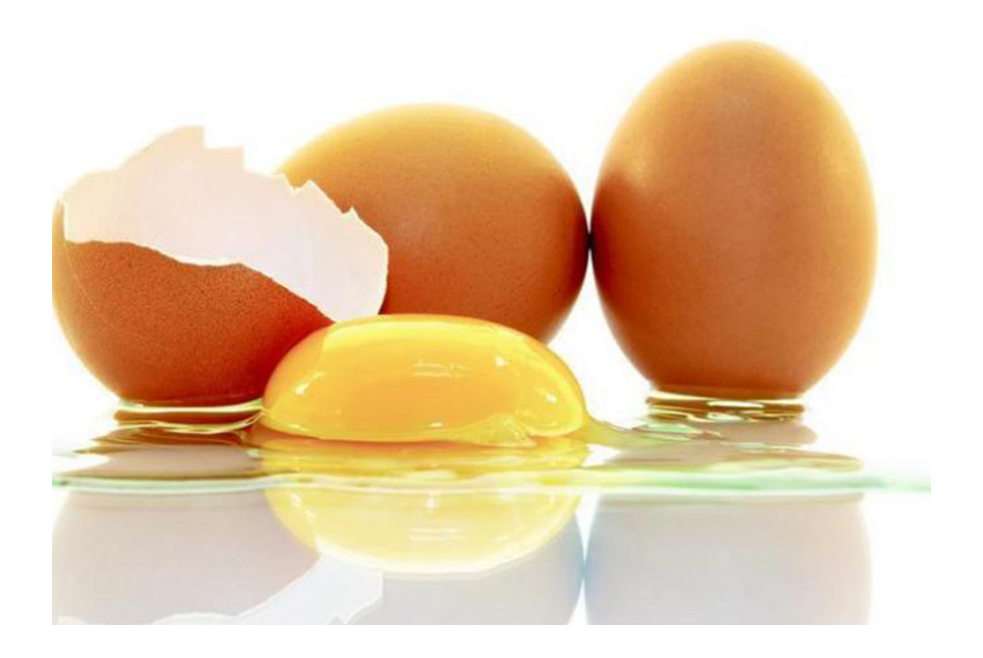
Eggs (chicken, goose, duck, ostrich, etc.)