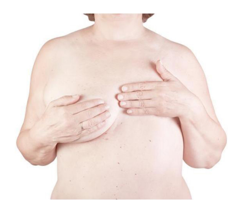
Cancer (colon, breast, prostate, uterus, etc.)