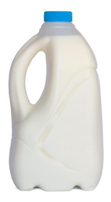
Milk (cow, buffalo, goat or any animal milk)