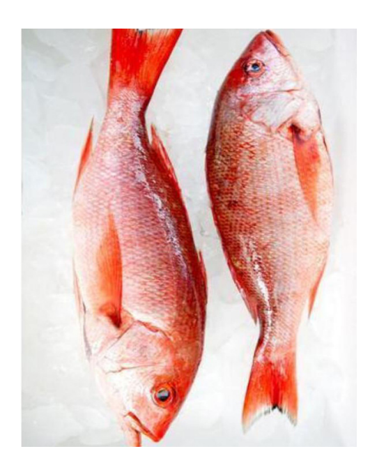
Fish (salmon, tuna, trout, perch, etc.)